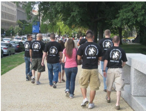
More Photos from the Army Ten-Miler