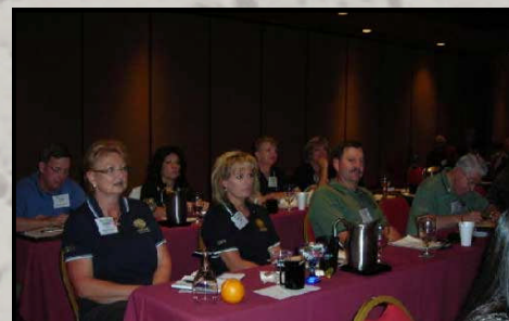
Sunshine Chapter Members Huntsville, AL

Congratulations AUSA Sunshine Chapter—Job Well Done!