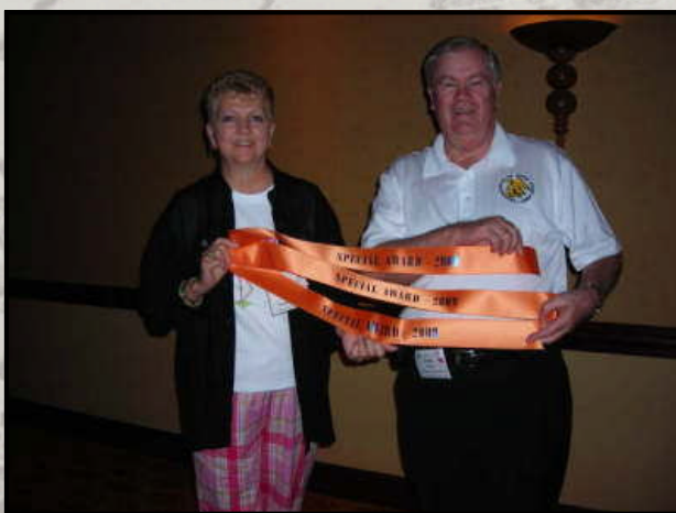
Sunshine Chapter Presented Awards - Third Region