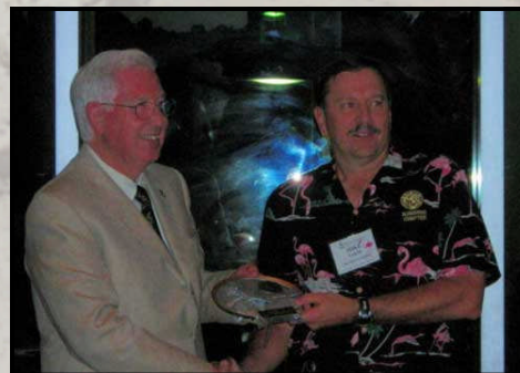
Presentation, Huntsville, AL