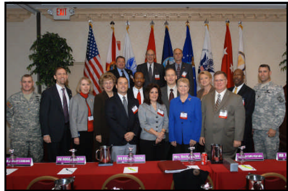
AUSA & AFCEA TechNet Orlando Team